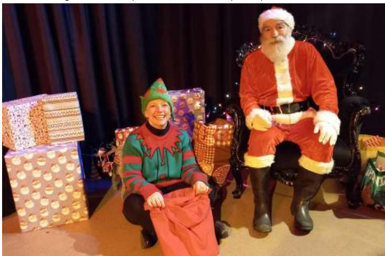
Santa and his chief elf, fresh from the North Pole in their special Grotto

So if they are the ingredients the best children's party ever then that's exactly what happened in Mayfield on Sunday the 8th of December when the MARNA Children's Christmas Party Took place at the Memorial Hall... oh and you can add to that a full magic show complete with audience participation.