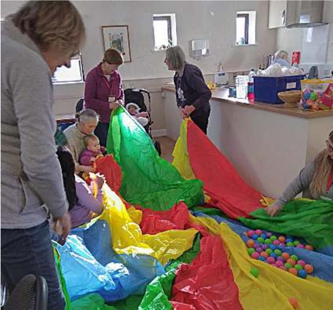
Making the Bubbling pool with all hands to help and below the obstacle course helping the crippled man into the pool (sort of!)