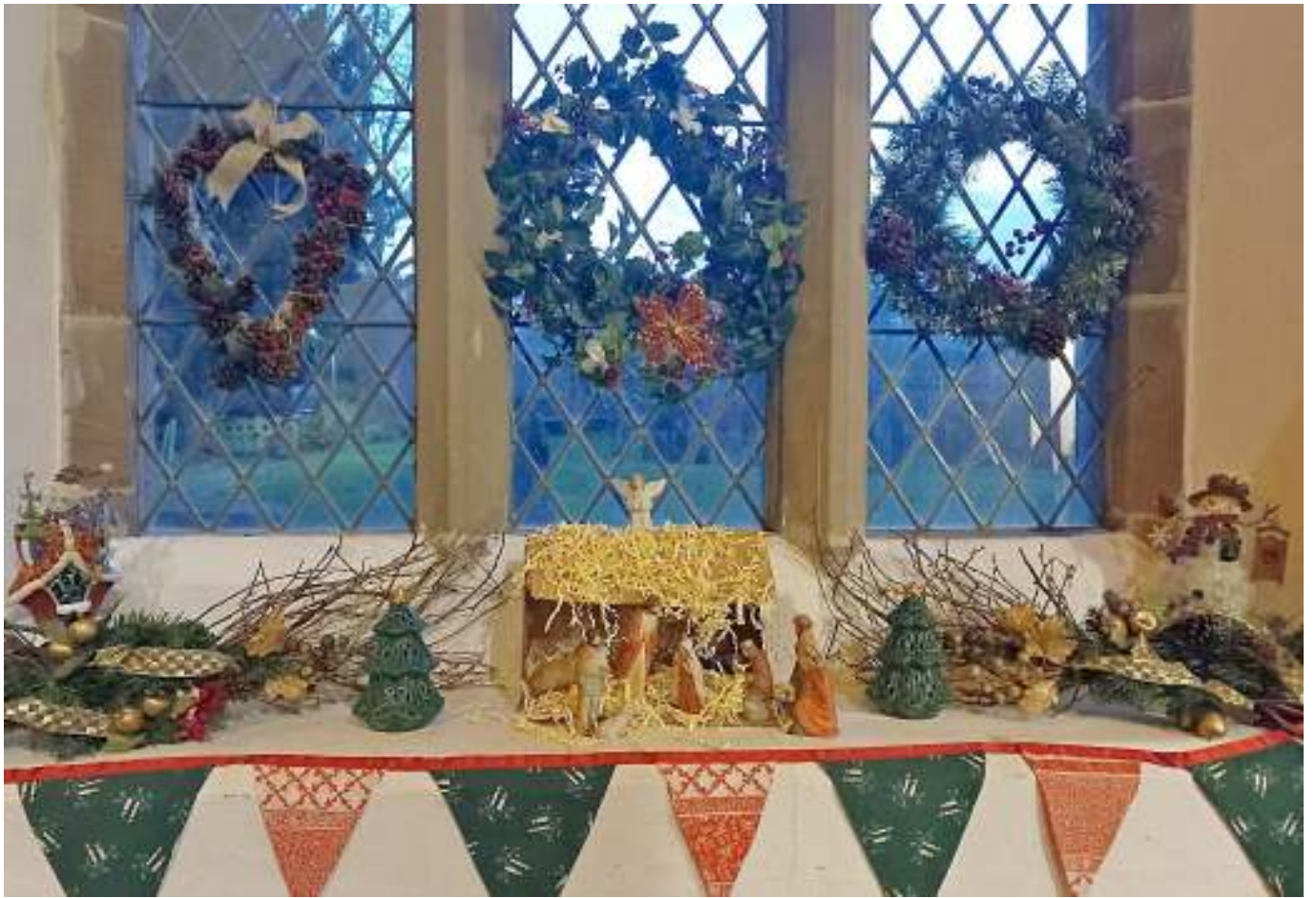
A crib scene, complete with beautiful hanging wreaths and a whole host of decorations, contrasted nicely with silver stars and silver branches to match the carol 'Oh Holy Night, the stars are shining brightly, it is the night of our dear saviour's birth.'